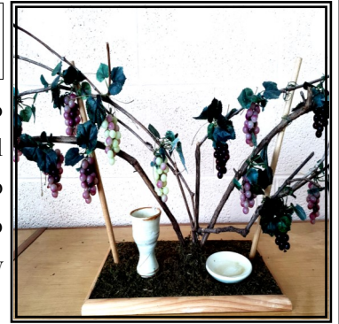
Level II: True Vine material

The parable of The True Vine is the heart of the Level II atrium. This parable is split into three moments for our 1st, 2nd, & 3rd graders and is a key part of Sacramental Preparation for 1st Eucharist and Reconciliation. We read John 15:1-11, which lifts up The True Vine as a new image that Jesus gives us of his true identity and our relationship to him. Jesus says, "I AM the True Vine and you are the branches." Jesus is not only revealing Himself, but also telling us who we are in His heart and mind.