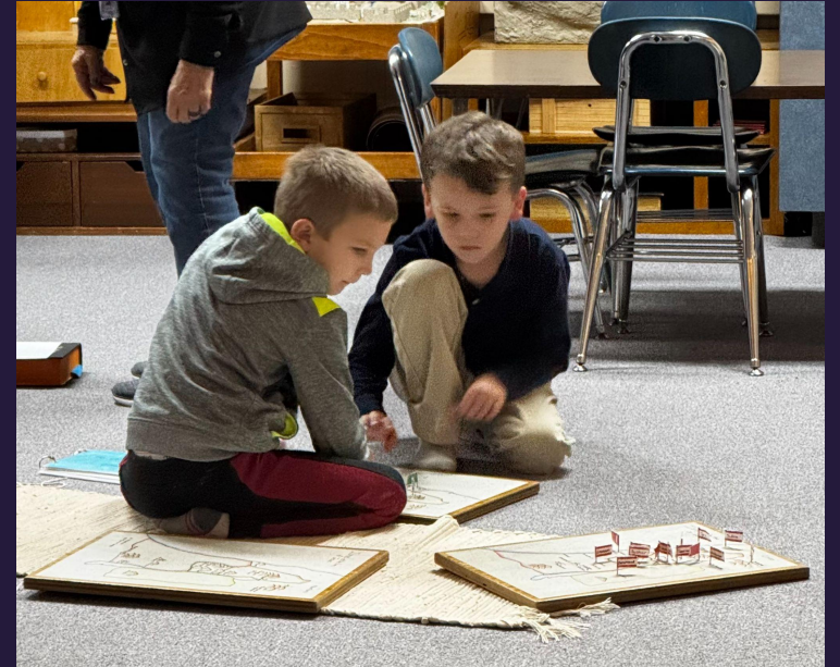
Level Two children working with the Pin Maps (for the Land of Israel)