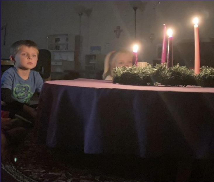
Around the prayer table in Level One with the Advent Wreath