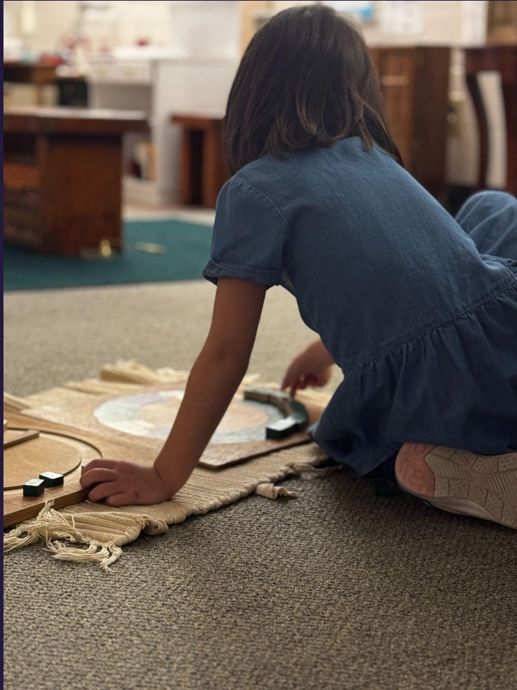
Level One child working with the Liturgical Calendar